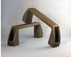
092002 Strap Handle Material: Nylon-Fiberglass reinforced Color: Black