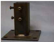
FWEB41STQT Floor Base Steel Flanged Black Powder Coath 1 1/2" x 1 1/2" and 40mm extrusion