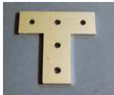
5TJP 1515 5 Hole T Joining Plate Material: anodized aluminum Finish: clear anodized