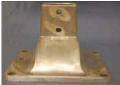
FBM1515CA Floor Base Die Cast Aluminum For use with 1 1/2" x 1 1/2" and 40mm extrusion