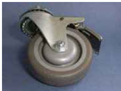
No-Mar Caster with Brake 3 1/2" Diameter 1/2-13 Stem For use with 1 1/2" x 1 1/2" extrusion