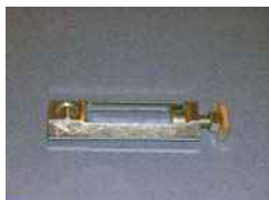
15MC 099D084 Milling T-Slot Connector No machining required. Clean, Flush look Use with 8mm or 5/16" slot profiles