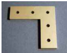
5LJP 1515 5 Hole L 90° Joining Plate Material: anodized aluminum Finish: clear anodized