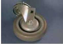
No-Mar Caster without Brake 3 1/2" Diameter 1/2—13 Stem For use with 1 1/2" x 1 1/2" extrusion