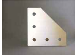
15JP 4507 5 Hole 90° Joining Plate Material: anodized aluminum Finish: clear anodized