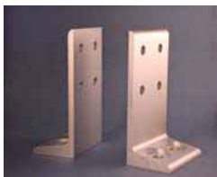
15FF 5830 Floor Mount For use with 1.5" x 3.0" Extrusion Material: Aluminum Finish: Clear Anodized