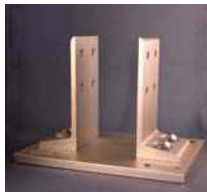
15FF 5833 Heavy-Duty Floor Mount Floor mount w/ base plate. For use with 3.0" x 3.0" Extrusion (shown). Also available for use with 1.5" x 3.0" Extrusion.