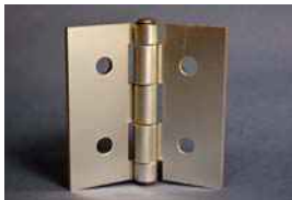
15HI8514 Aluminum Butt Hinge Material: Aluminum Hinge, Steel Pin 75 lb. Capacity per Hinge