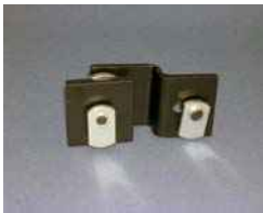
EF22HD Heavy-Duty Magnetic Door Latch Assembly Material: Steel Finish: Zinc Plate and Black Powder Coat