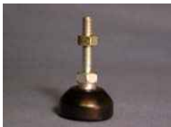
LF-1515 Leveling Feet Accommodates uneven floors or slight inclines 5/16—18 Stem 1 1/2" No Skid Pad For use with 1 1/2" x 1 1/2" extrusion Other Sizes & Styles Available