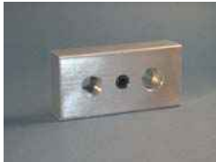
CM06047-1515 IAC Custom Caster Plate Tapped 1/2—13 For use with 1 1/2" x 1 1/2" extrusion